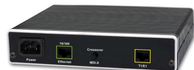
Model 2603—T1/E1 Interface