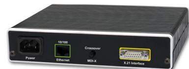
Model 2621—X.21 Interface