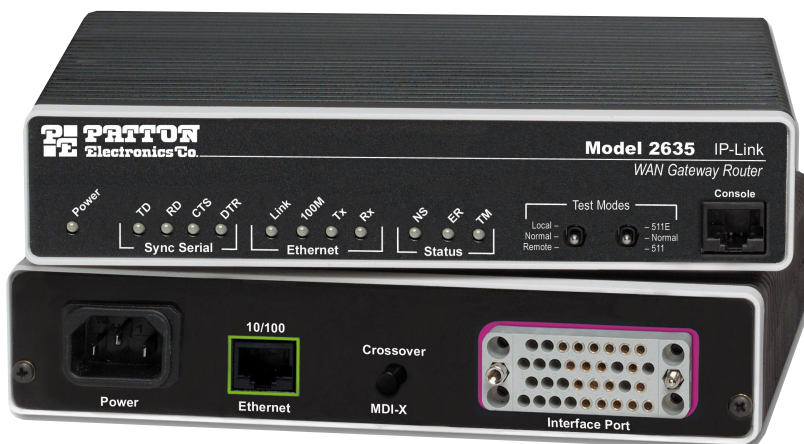
IPLink Gateway Router