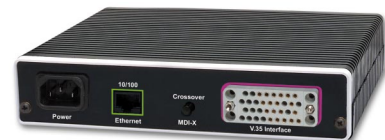
Model 2635—V.35 Interface